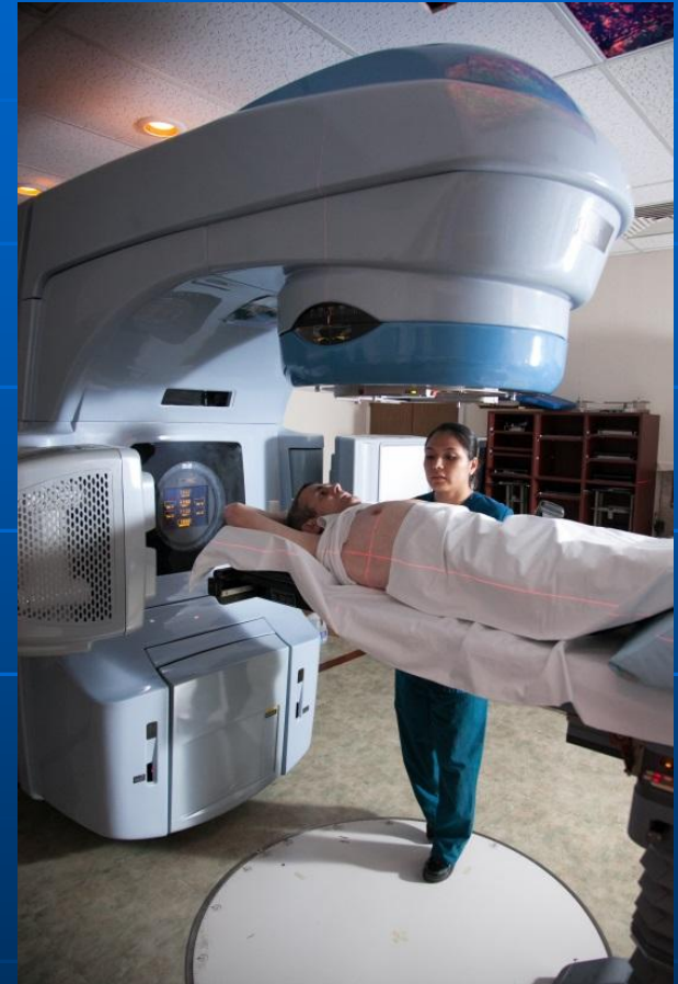
Patient being treated with modern radiation therapy equipment.