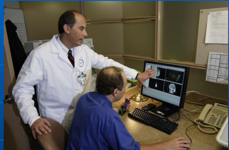
Radiation oncologist and dosimetrist creating a treatment plan