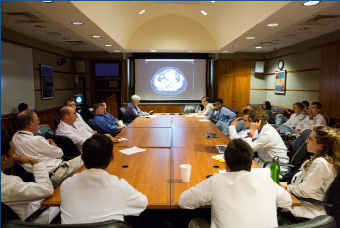
Tumor boards meet to discuss comprehensive patient treatment plans